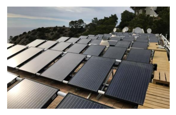
PVT market situation from Task 60 2019 survey and example of a glazed PVT application for a hotel.